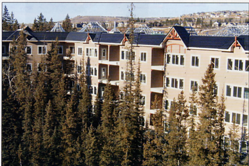
The steel cladding of the mansard roof is attached to 25.4 mm (1") wide by 1.22 mm (.048") deep Z-bar subgirts applied horizontally at .61 m (2 ft) on centre to the roof framing.

Phases 2 and 3 are each 26,105 m 2 (281,000 ft 2 ), comprising 207 residential units. Phase 4 will be 18,580 m 2 (200,000 ft 2 ) with 158 units plus an amenities area with a health club and social centre. The MBS system was chosen because of its year-round con-